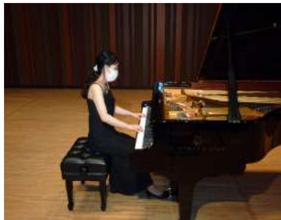
preferable examples_angle of view