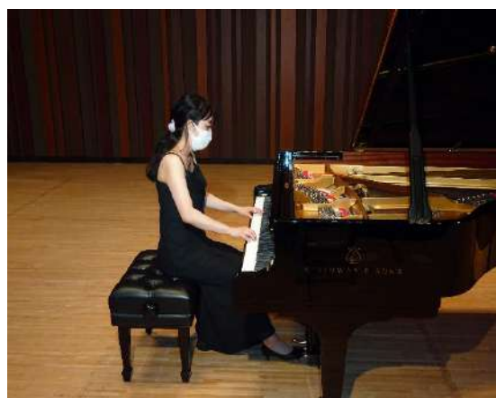
preferable examples_angle of view